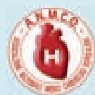
Associazione Nazionale Medici Cardiologi Ospedalieri (ANMCO)